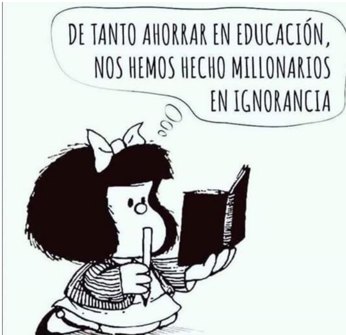
Image translation: By saving so much on education, we have become millionaires in ignorance.

longer call you servants because a servant does not know his master’s business. Instead, I have called you friends, for everything that I learned from my Father I have made known to you. You did not choose me, but I chose you and appointed you so that you might go and bear fruit—fruit that will last—and so that whatever you ask in my name the Father will give you. This is my command: Love each other.”