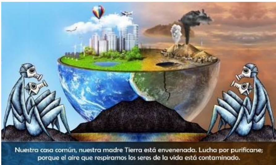
Image translation: Our common home, our mother Earth is poisoned. She struggles to purify herself; because the air that the beings of life breathe is polluted.

“Anything that happens to the Earth, will happen to Earth's children”.